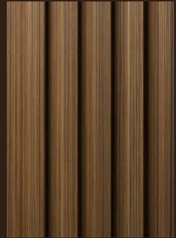
116 Flamed Teak