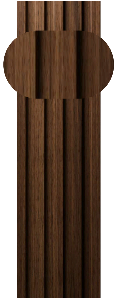
1500 113 Smoked Walnut