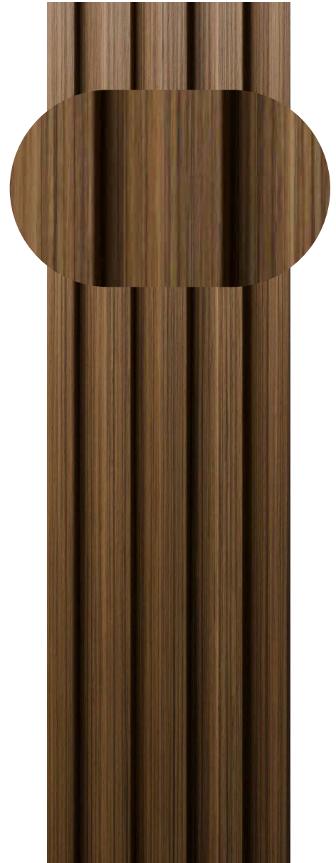
1500 1 1 6 Flamed Teak