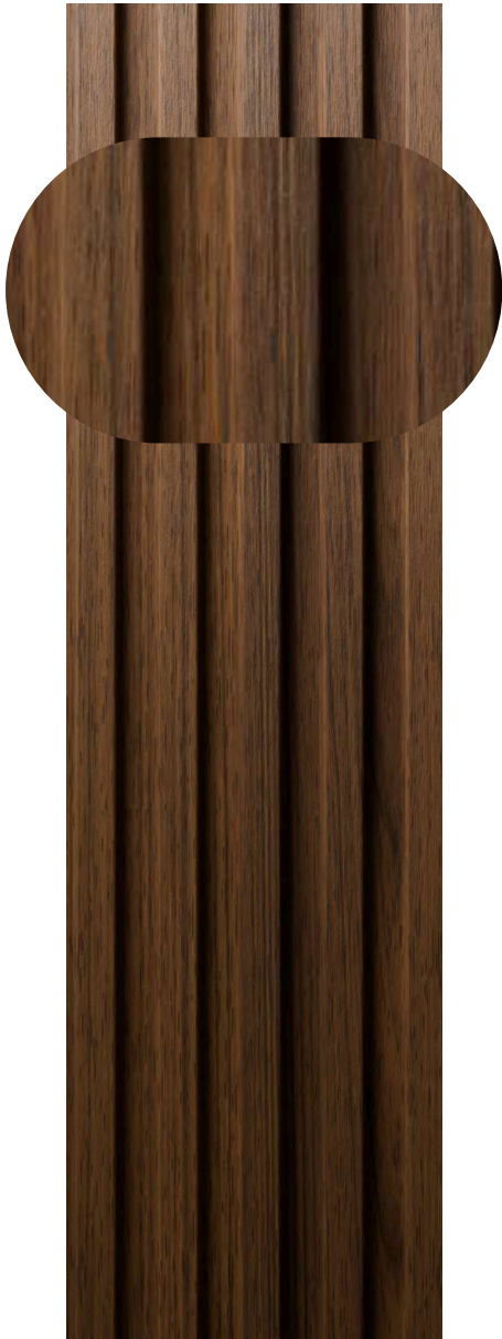
1500 111 Nogal