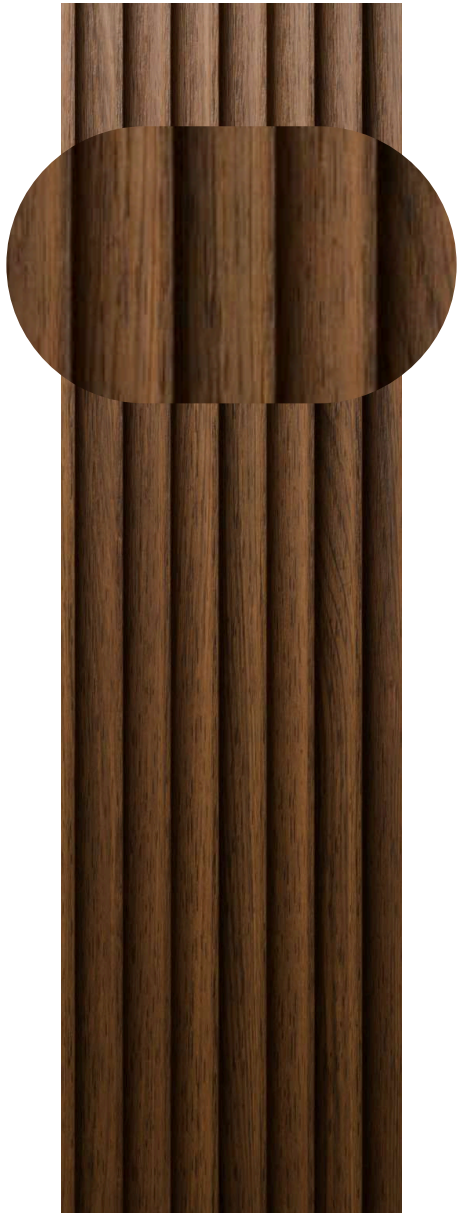
1800 111 Nogal