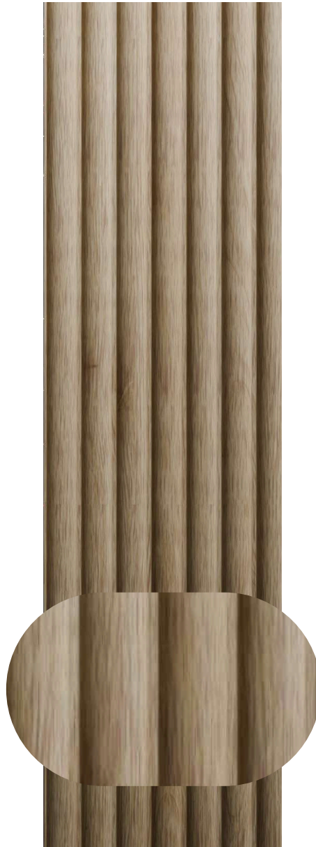
1800 112 Oak