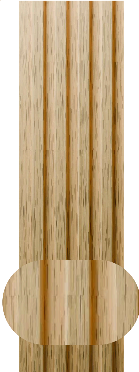
1500 1 1 5 Rift Oak