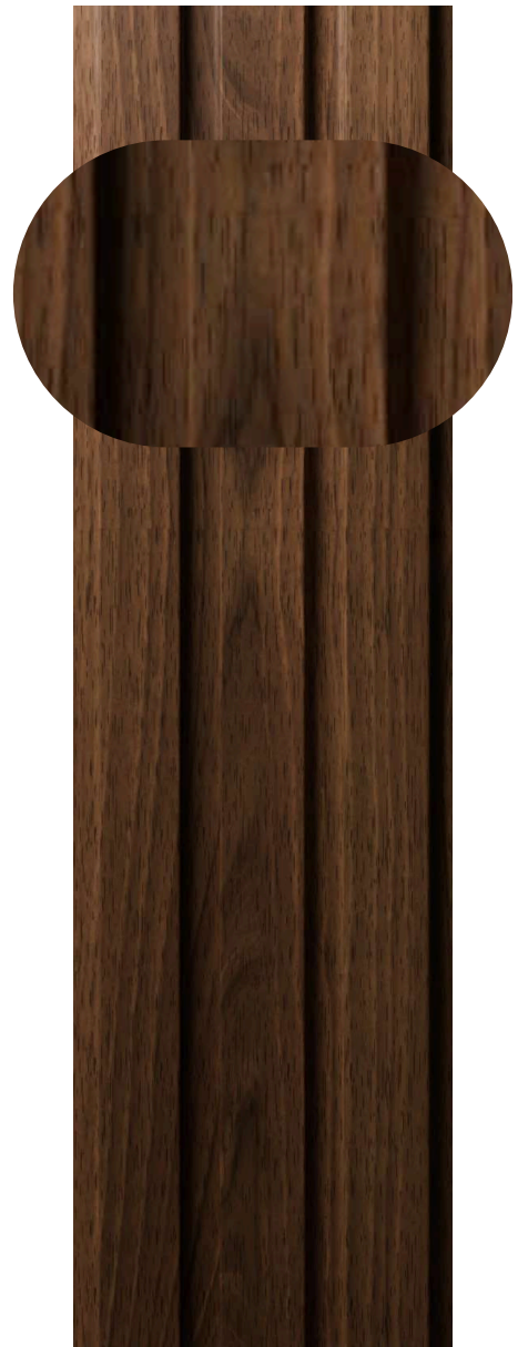
1300 113 Smoked Walnut