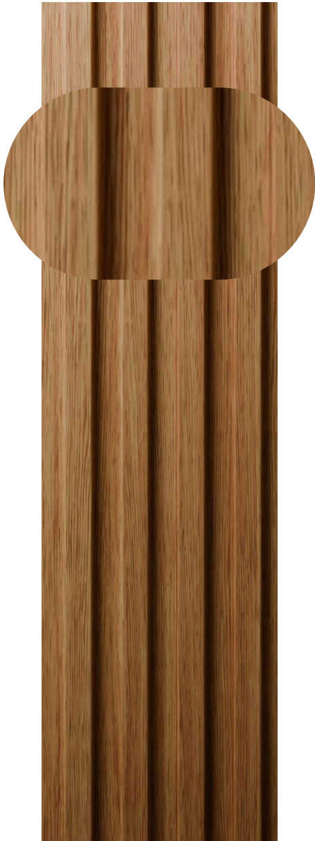
1500 1 1 4 Striped Teak