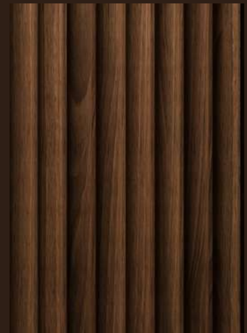
113 Smoked Walnut