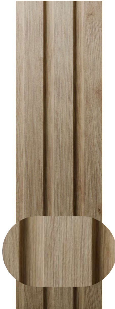
1300 112 Oak