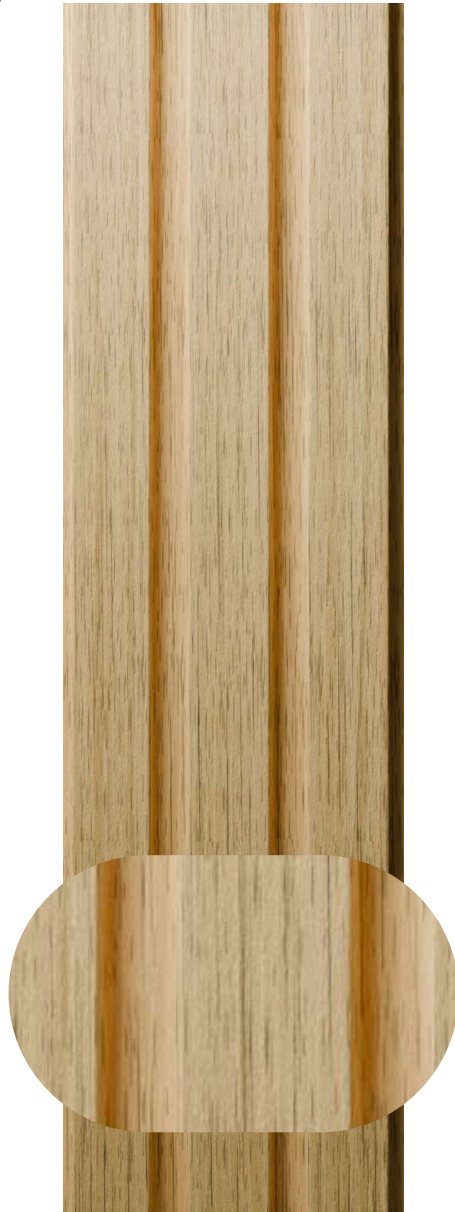
1300 1 1 5 Rift Oak