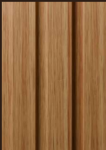
114 Striped Teak