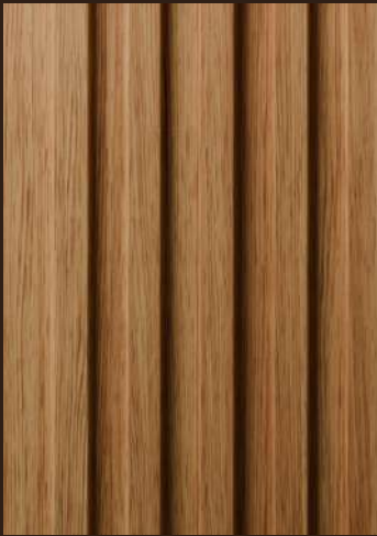
114 Striped Teak