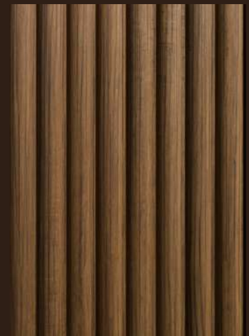
116 Flamed Teak