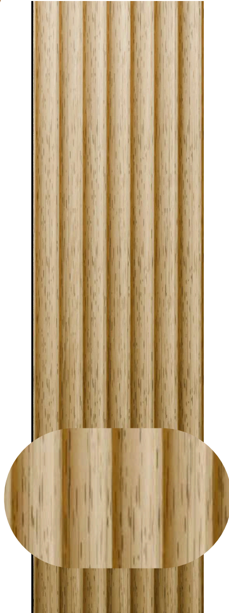
1800 115 Rift Oak