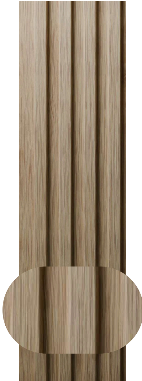
1500 112 Oak