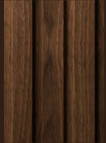
113 Smoked Walnut