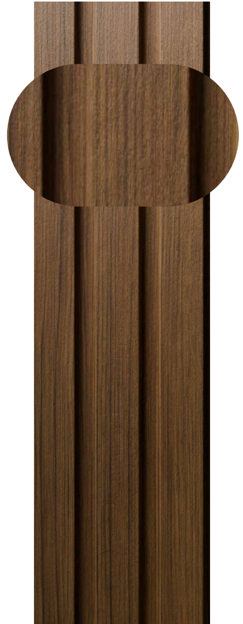
1300 1 1 6 Flamed Teak