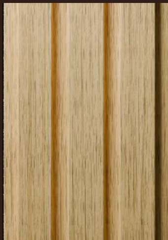
115 Rift Oak