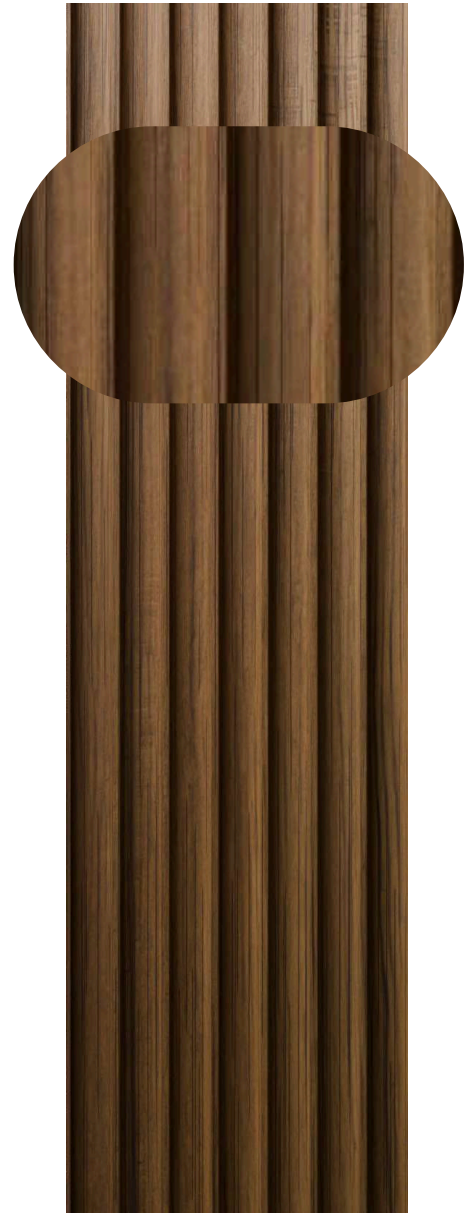
1800 116 Flamed Teak