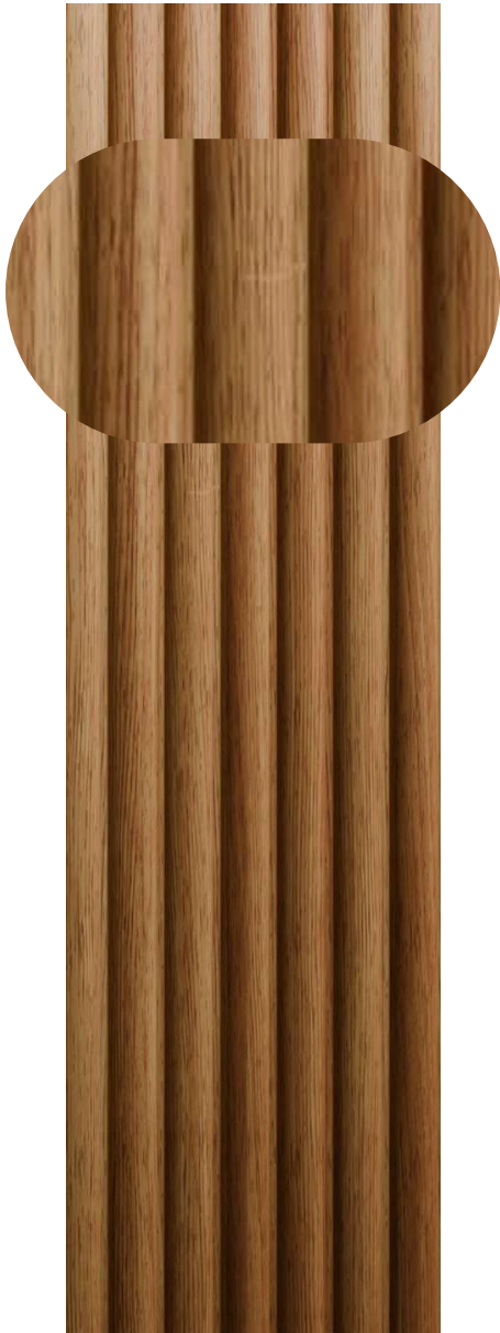
1800 114 Striped Teak