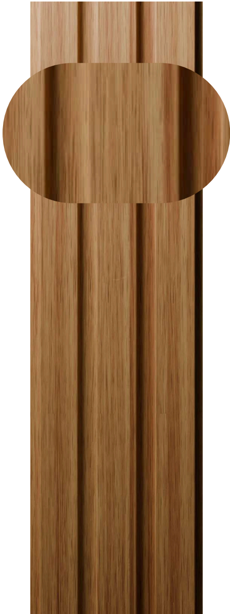
1300 1 1 4 Striped Teak