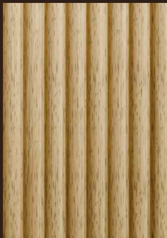
115 Rift Oak