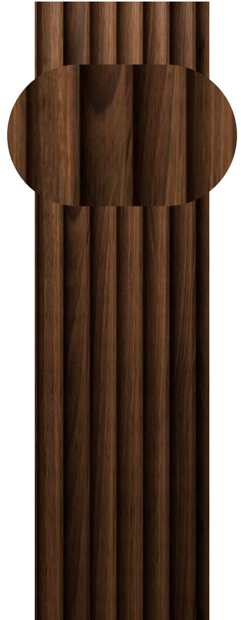
1800 113 Smoked Walnut