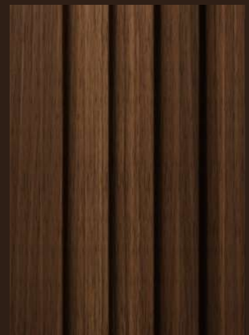
113 Smoked Walnut