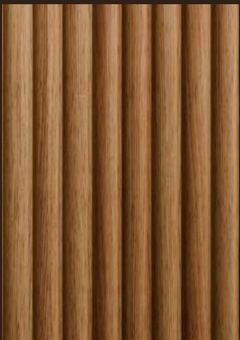
114 Striped Teak