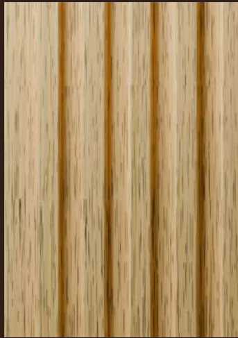
115 Rift Oak