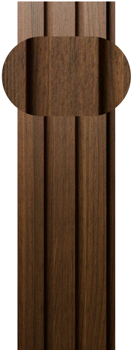
1300 111 Nogal