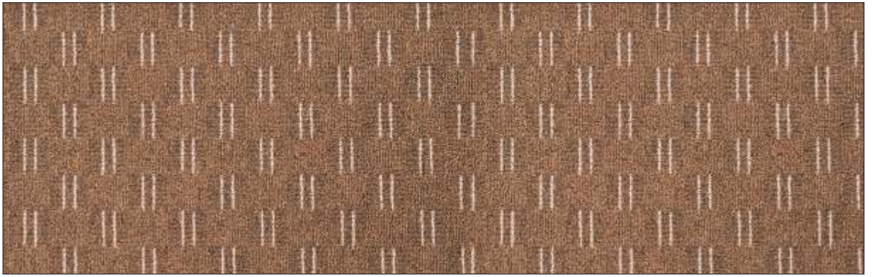
2 LINE - BROWN