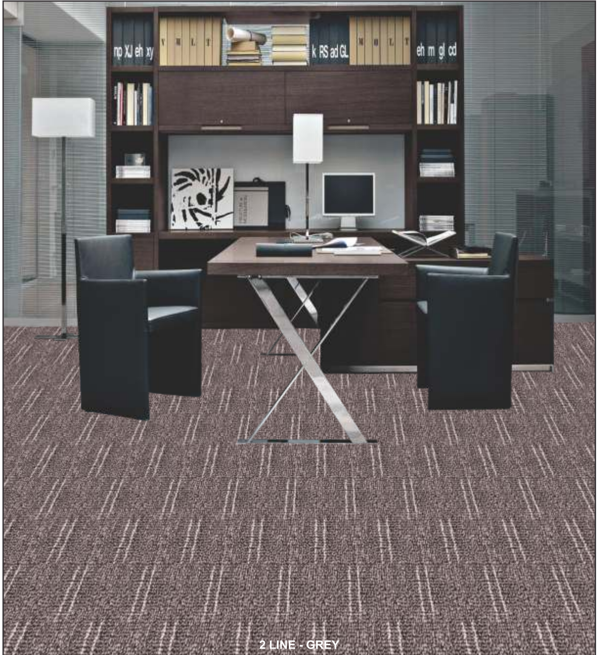
2 LINE - GREY

* picture only for design illustration for actual colour refer to the product