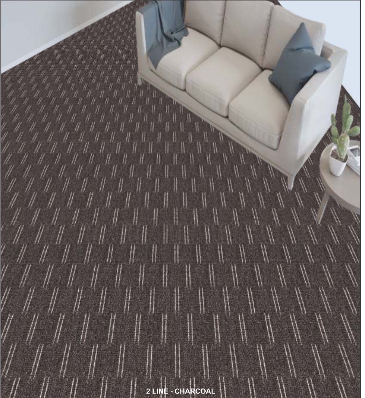
2 LINE - CHARCOAL

* picture only for design illustration for actual colour refer to the product