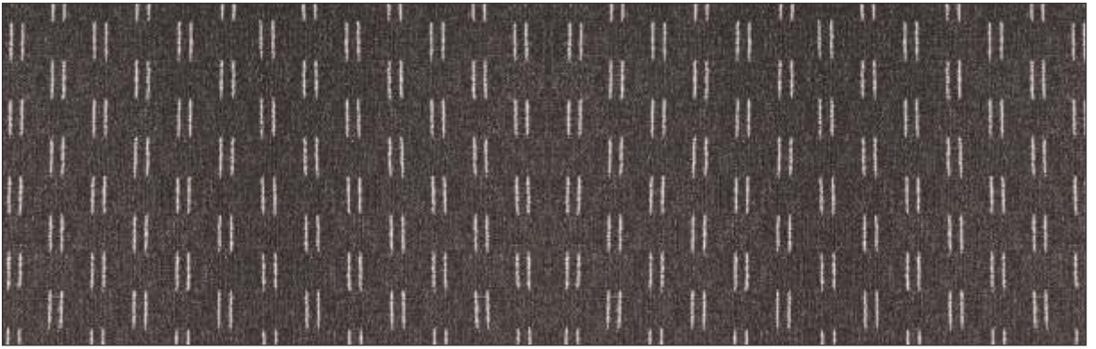
2 LINE - CHARCOAL