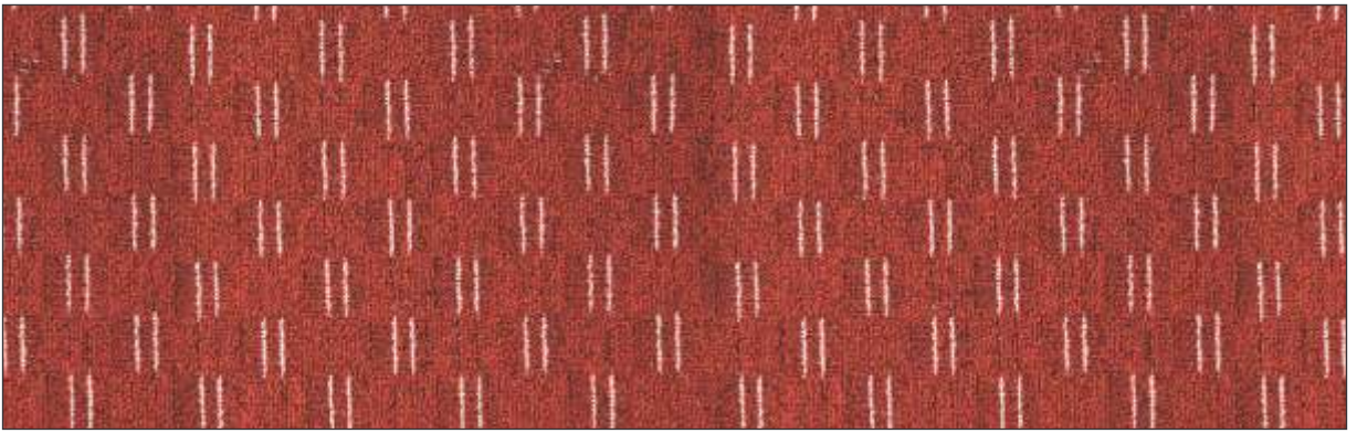
2 LINE - MEHROON