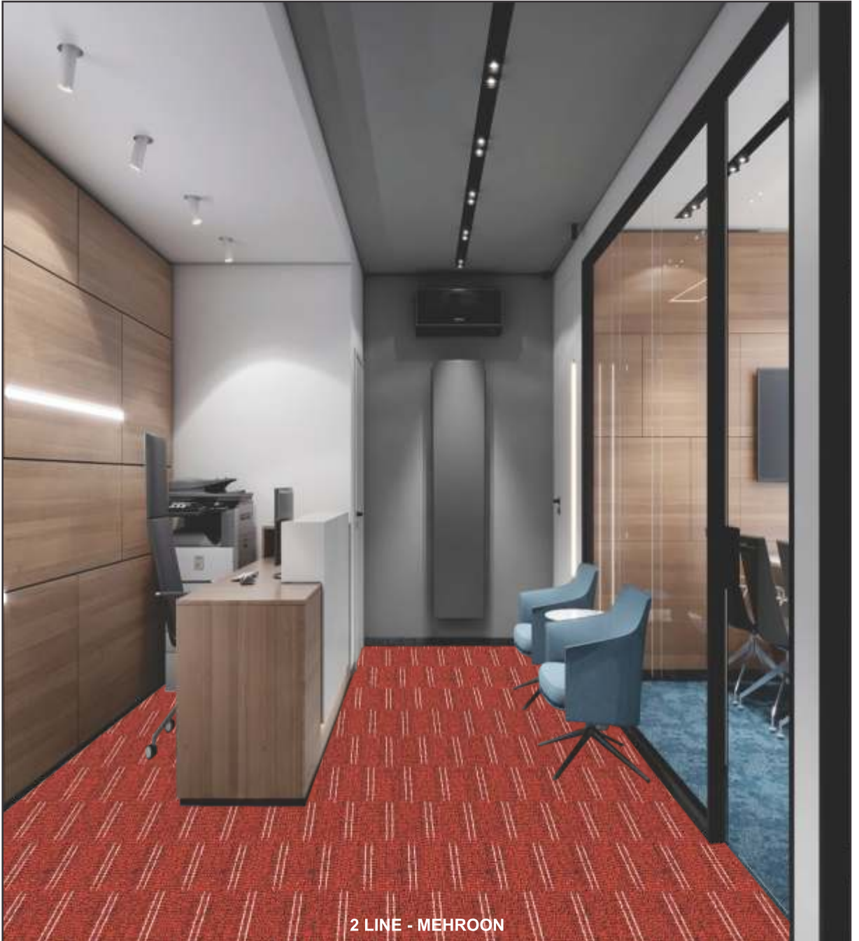
2 LINE - MEHROON

* picture only for design illustration for actual colour refer to the product