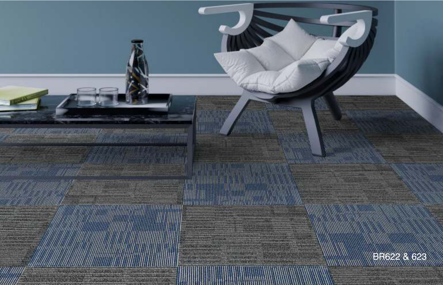
BR622 & 623